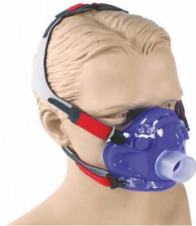
OroNasal 7450 V2 Mask™ with Headgear and Custom Mask Adapter