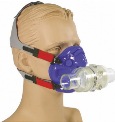
OroNasal 7450 V2 Mask™ with Headgear and way T-shape™ Non Rebreathing Valve